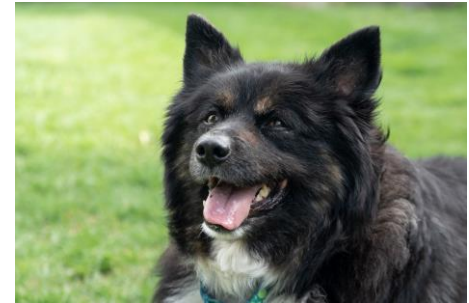
EHS Pet Dixie, Adopted April 2021

By sponsoring a kennel for one year , you are helping us to provide a safe space for the animals who enter our shelter and give them the care and treatment they need to have a chance at finding a new, loving family. Beyond sheltering, you are also helping to further our work in supporting happy, lifelong bonds with their pets by providing education, training and resources for pet guardians.