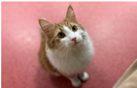
EHS Pet Buddy, Adopted May 2021

As a non-profit, nearly 70% of EHS' funding comes from our community from special events, donations, and fundraising initiatives -- including Kennel Sponsorship . This support comes from people like you : kind-hearted, caring individuals and organizations who want to improve the lives of companion animals.