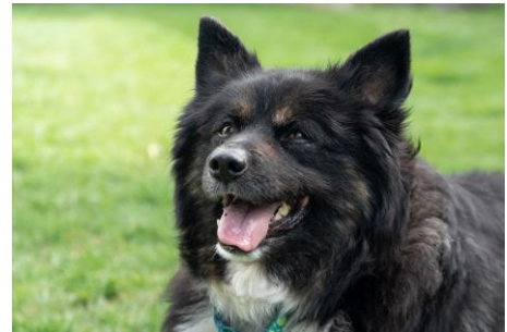
EHS Pet Dixie, Adopted April 2021

By sponsoring a kennel for one year , you are helping us to provide a safe space for the animals who enter our shelter and give them the care and treatment they need to have a chance at finding a new, loving family. Beyond sheltering, you are also helping to further our work in supporting happy, lifelong bonds with their pets by providing education, training and resources for pet guardians.