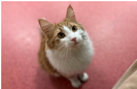
EHS Pet Buddy, Adopted May 2021

As a non-profit, nearly 70% of EHS' funding comes from our community from special events, donations, and fundraising initiatives -- including Kennel Sponsorship . This support comes from people like you : kind-hearted, caring individuals and organizations who want to improve the lives of companion animals.